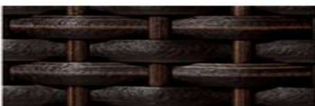
Mocca Java (528B)

All colours are available in Peel, round or webbing strip profiles in various sizes to suit your design and style.