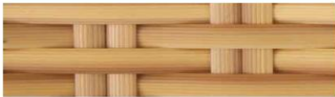
Honeywicker II (014B)