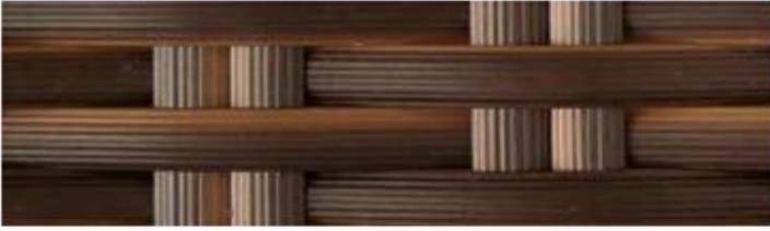
Java Brown (013B)

All colours are available in various profiles and sizes to suit your design and style.