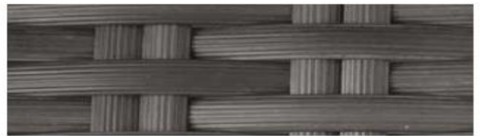
Graphite Black (654L)