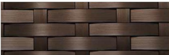
Shimmer Russet (75594)